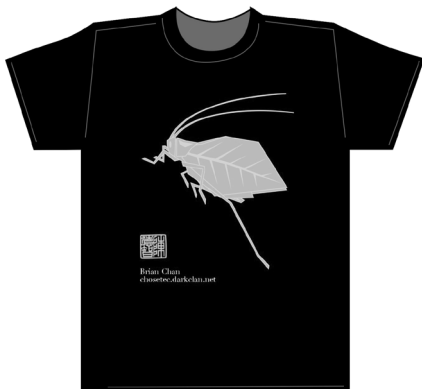
Leaf Katydid T-shirt (front) red and green on a black shirt