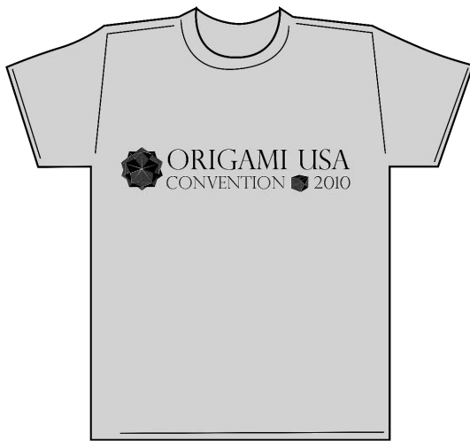
Convention Logo T-shirt (front) red, yellow and blue on a kiwi shirt

All t-shirt designs are tentative, and subject to change before printing.